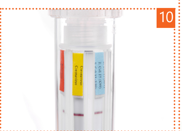
After 10 minutes, read the results using picture 11 as standard.

The liquid contained in the sample tube moves to the strip tube and slowly migrates along the strips.