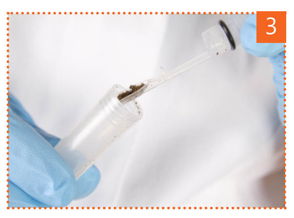
■ Dilute its content in the liquid of the small tube called sample