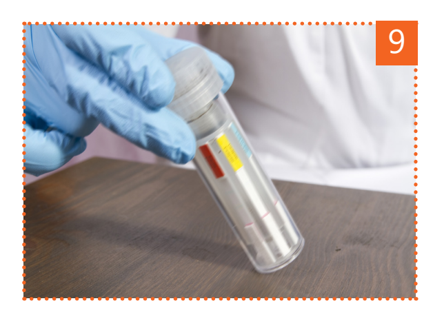
Sometimes, especially when the sample isn't homogenized, liquid migration can stop on one or more strips. In that case, tap the end of the strip tube on hard surface to allow migration to start again.