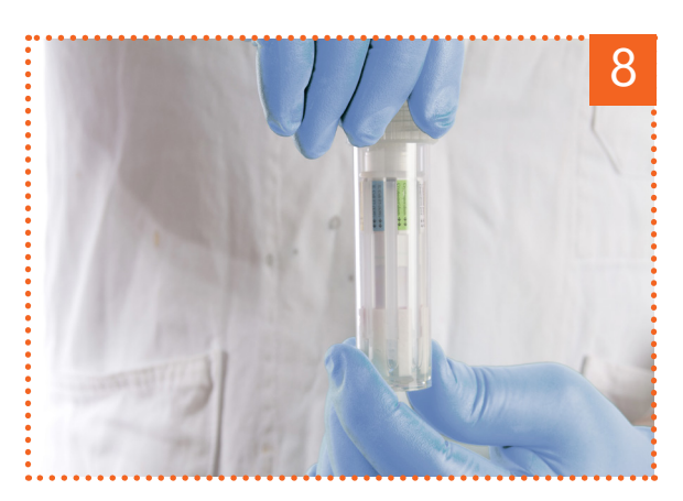
Screw the top of the strip tube.

You must hear two separate clicks, for perforation of superior and inferior septa of the sample tube.