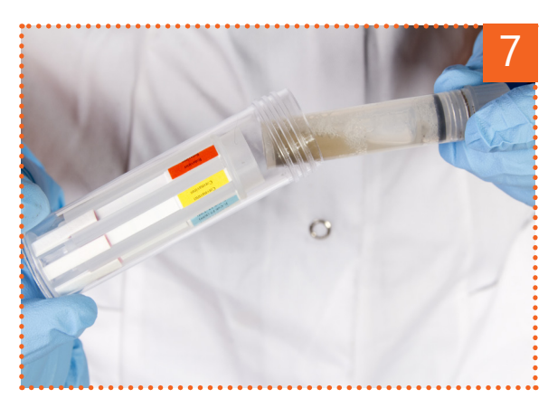
Insert the sample tube into the strip tube.