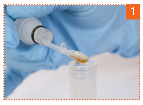
■ Take the faeces directly from the rectum of the lamb or the kid. If the samples are liquid, take a spoonful.